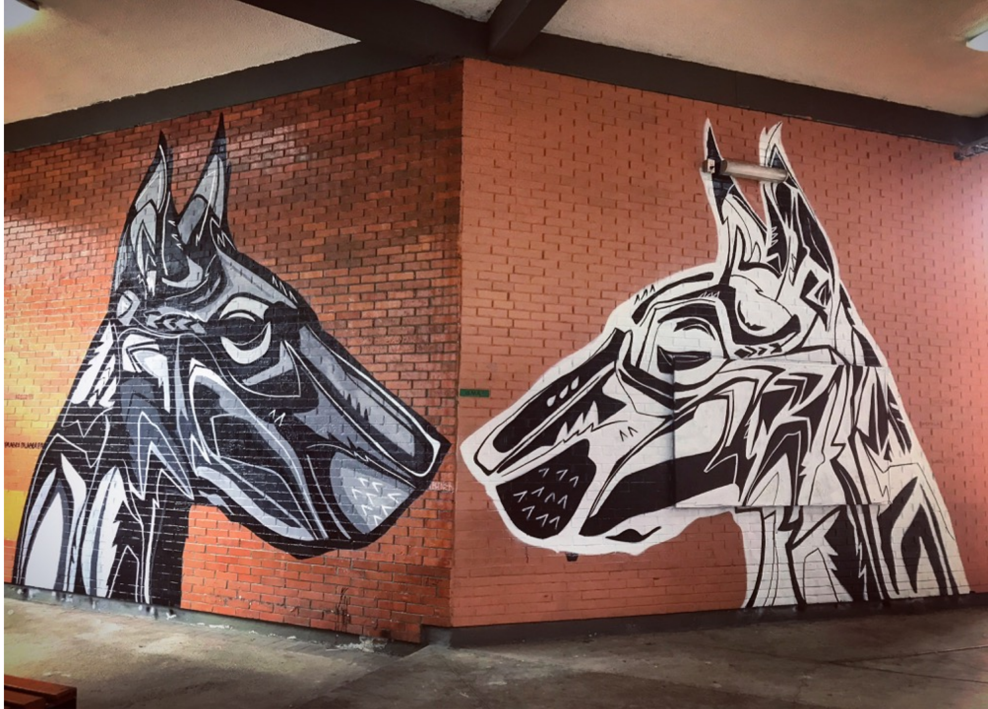
Xoloitzcuintli Mexico City 2019 Approx. 10 x 8 m