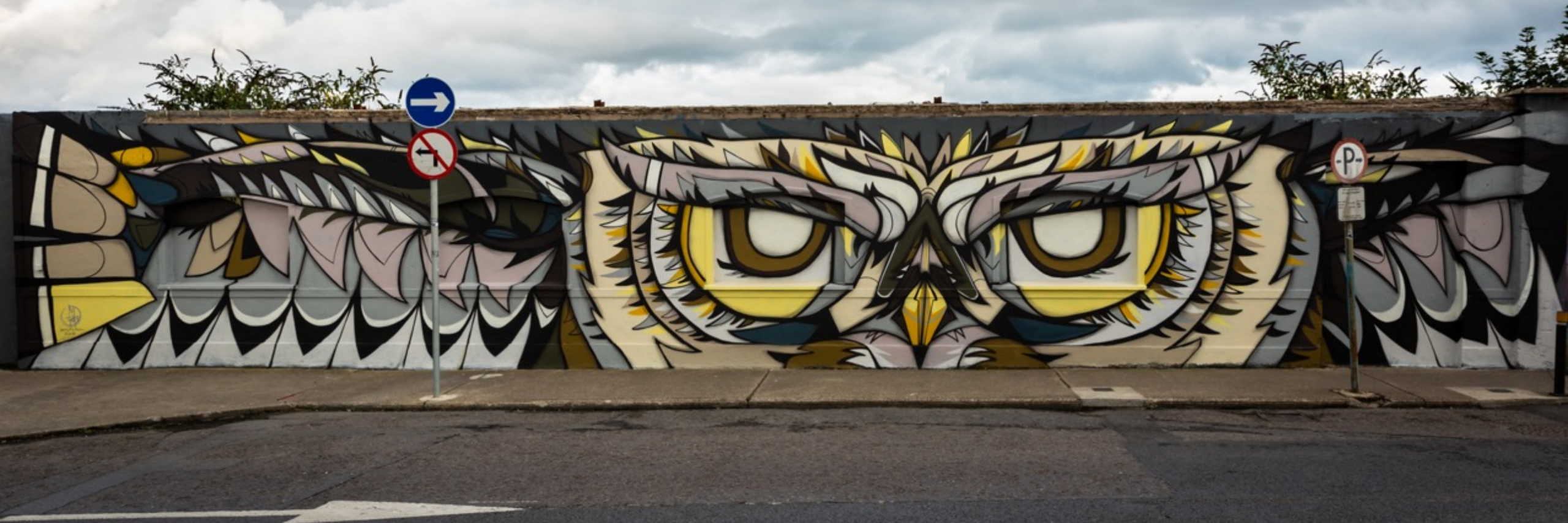
"Ceann Cait" Waterford, Ireland 2018 Approx. 22 x 4.5 m