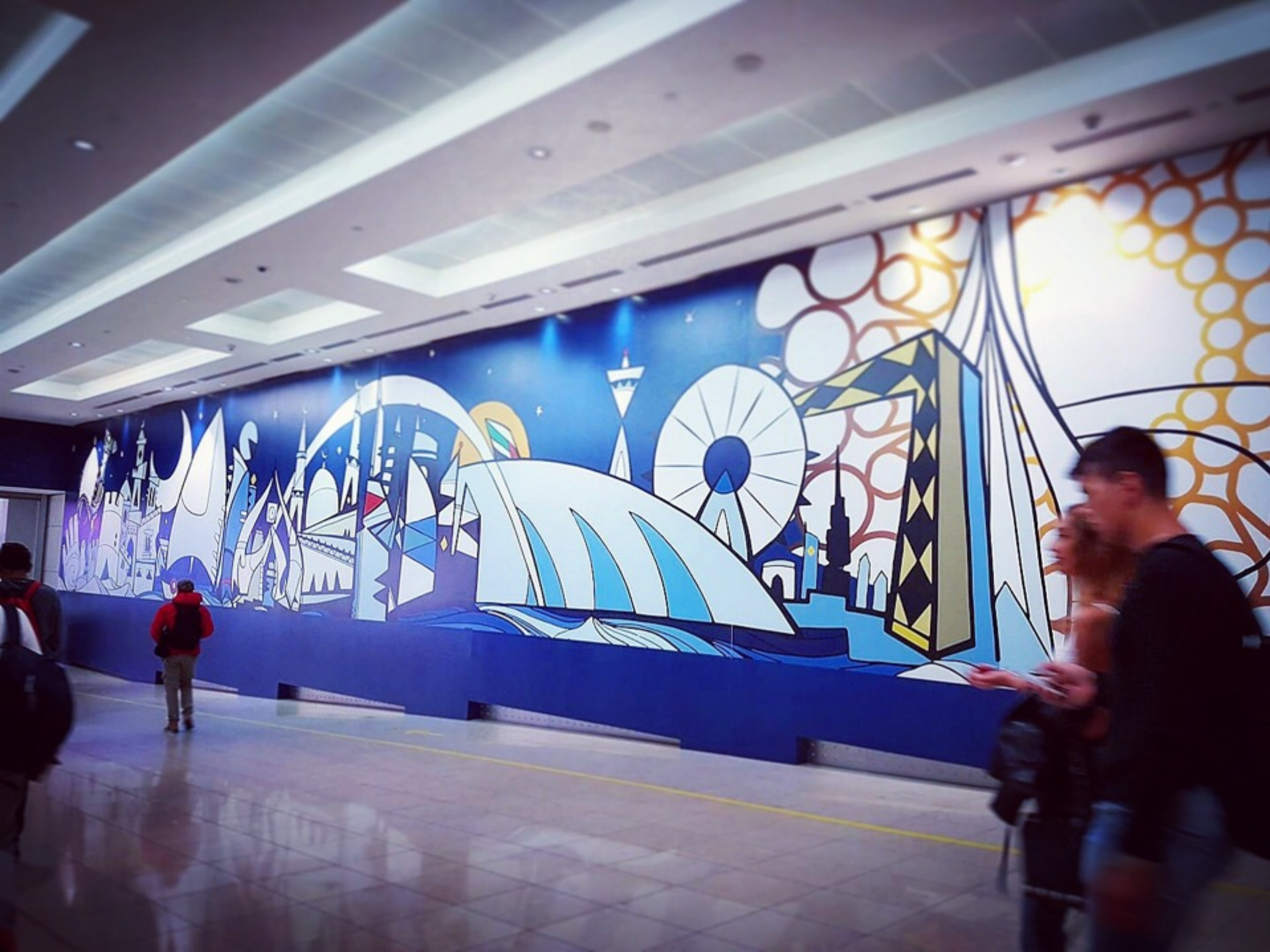
Dubai International Airport