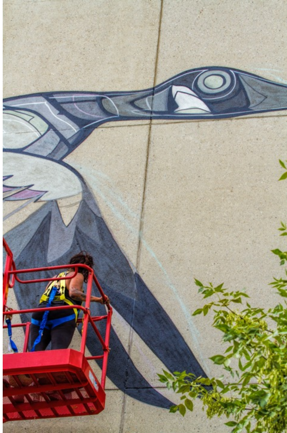
Migration Calgary 2019 Approx. 25 x 6 m