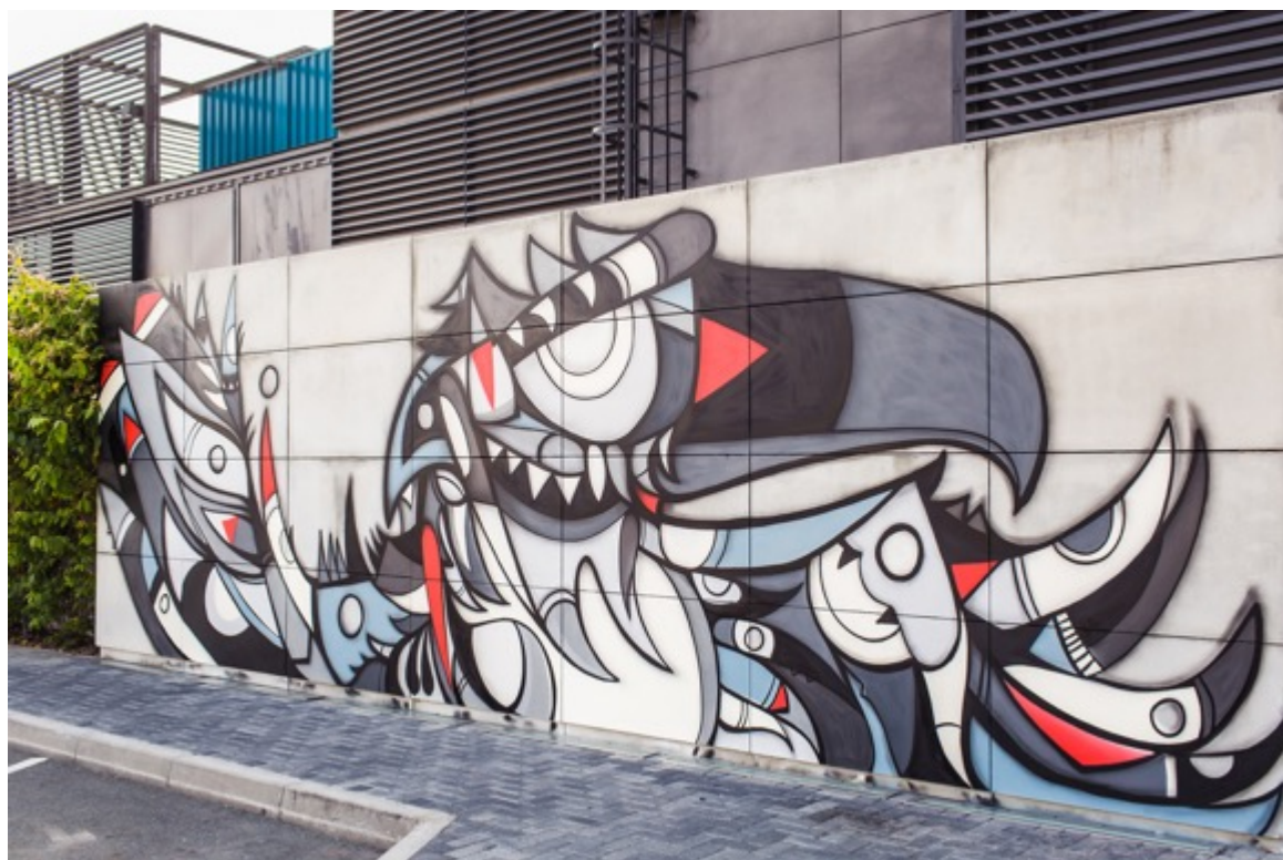
The Eagle and the Raven Box Park, Dubai 2017 Approx. 14x4m