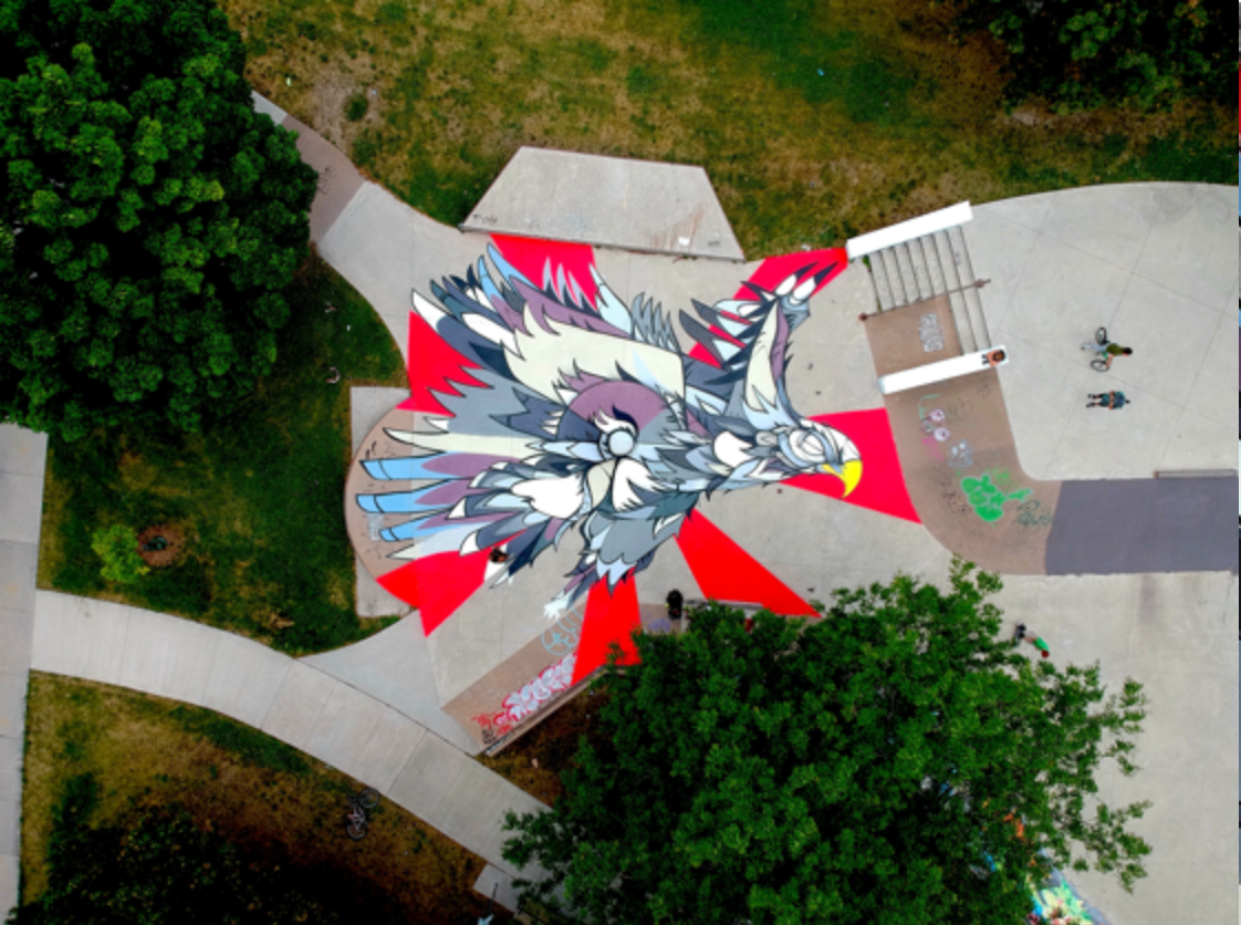
Eagle 8 th street skate park Toronto, Canada 2018 Approx. 9x9m